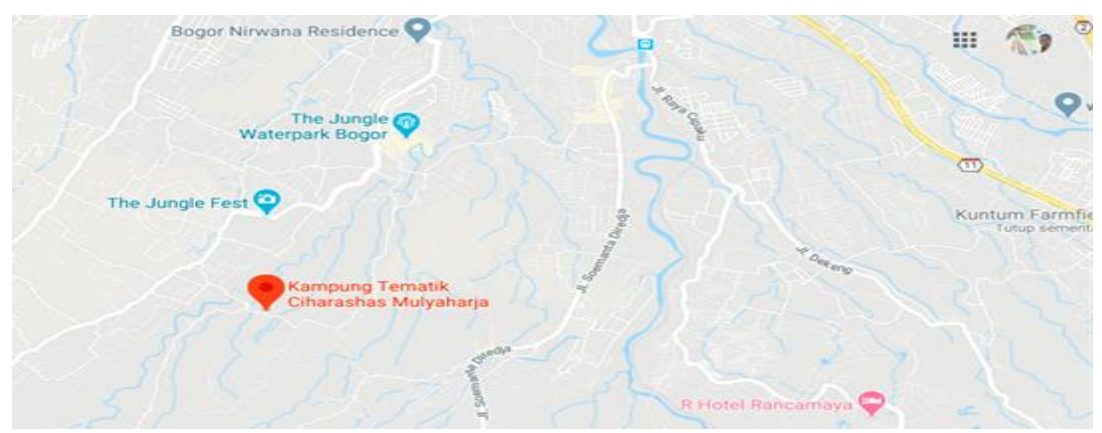
Figure 3. Map of thematic villages Mulyaharja