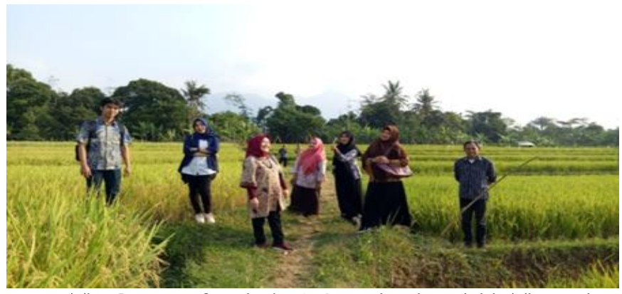
Figure 1. The Beauty of MulyaharjaOrganic Rice Fields Thematic Village