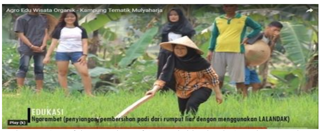
Figure 5. One of the attractions of Agro Edu Tourism is Organic Ngarambet Using Lalandak