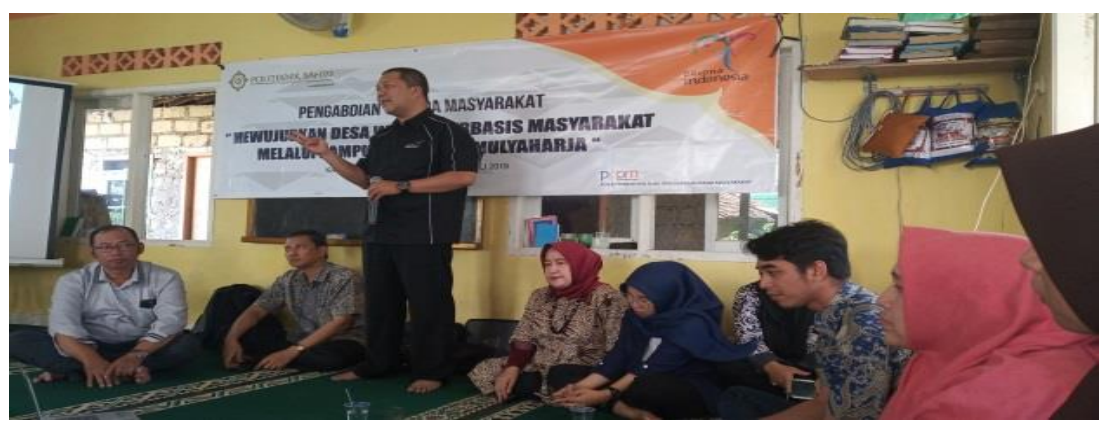
Figure 7. Counseling Tourism Awareness, Eight Tourism Tag Line, Tourism Village And Homestay