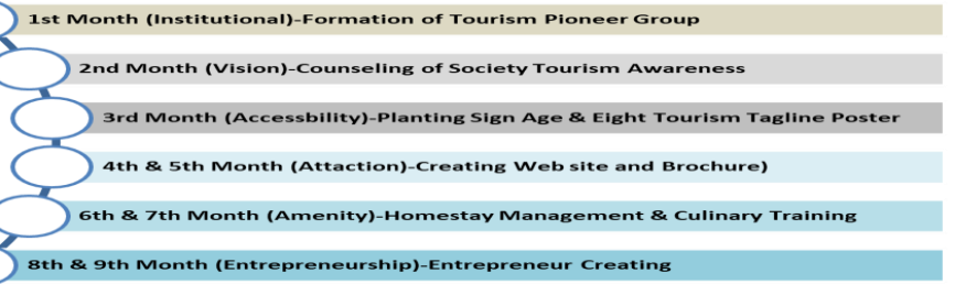
Figure 4. Solving Steps Chart Solving Problem Method