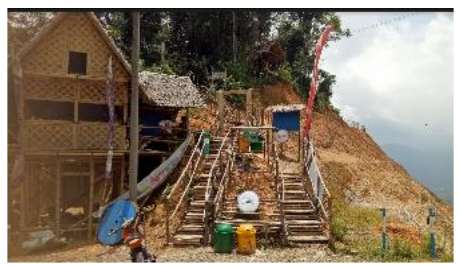
Figure 3. Entrance