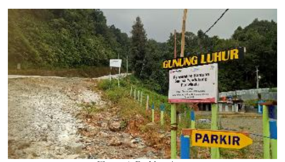
Figure 4. Parking Area