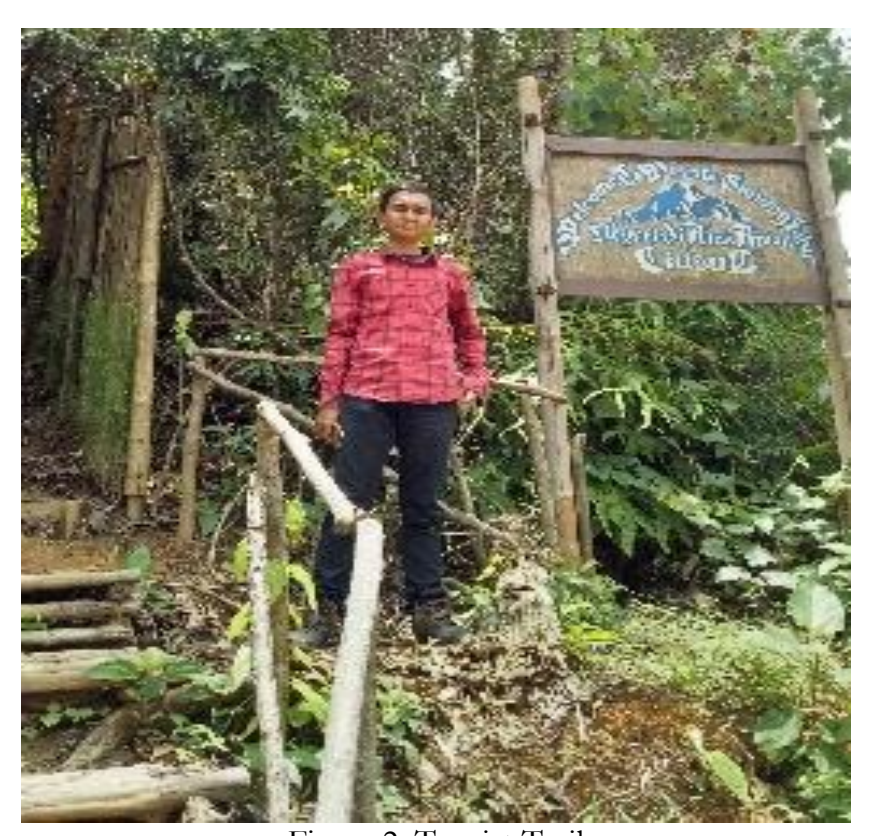
Figure 2. Tourist Trail