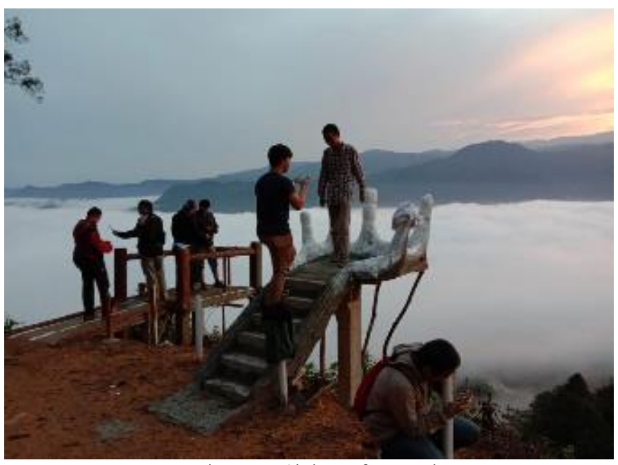
Figure 6. Sights of attractions

"Country Above the Clouds" provides a tourist attraction in the sight of a country that is above the clouds. The natural village of Citorek, Mount Luhur is at an elevation that gives beautiful natural beauty. Nature that can be seen as being above the clouds can be enjoyed at certain times, namely at 05.00 - 08.00 WIB.