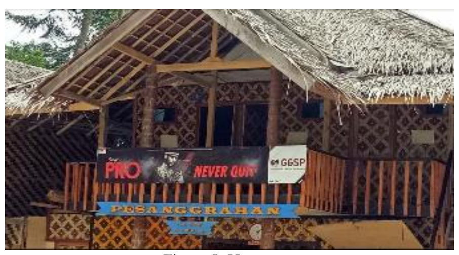
Figure 5. Homestay