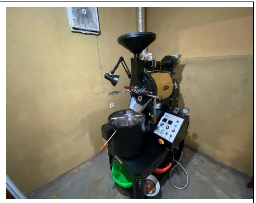
Figure 4. Post-harvest machines and roasting machines as a servicescape