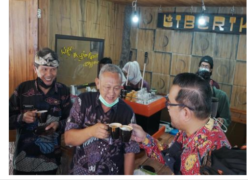
Figure 5. Espresso machine and coffee shop counter as a servicescape of Liberika Coffee

Figure 5 shows that Cipasung Liberika Coffee is able to bring visitors and tourists who love coffee, the agriculture department, STP Trisakti and other parties related to coffee management to the Saung (bamboo house) location. When guests come to Saung Kadu, they are served coffee prepared using very simple technology and manual brewing and an espresso machine. When the coffee powder is being tested, the next process is grinding the coffee beans into ready-to-drink coffee powder by using a manual brew technique, or using an